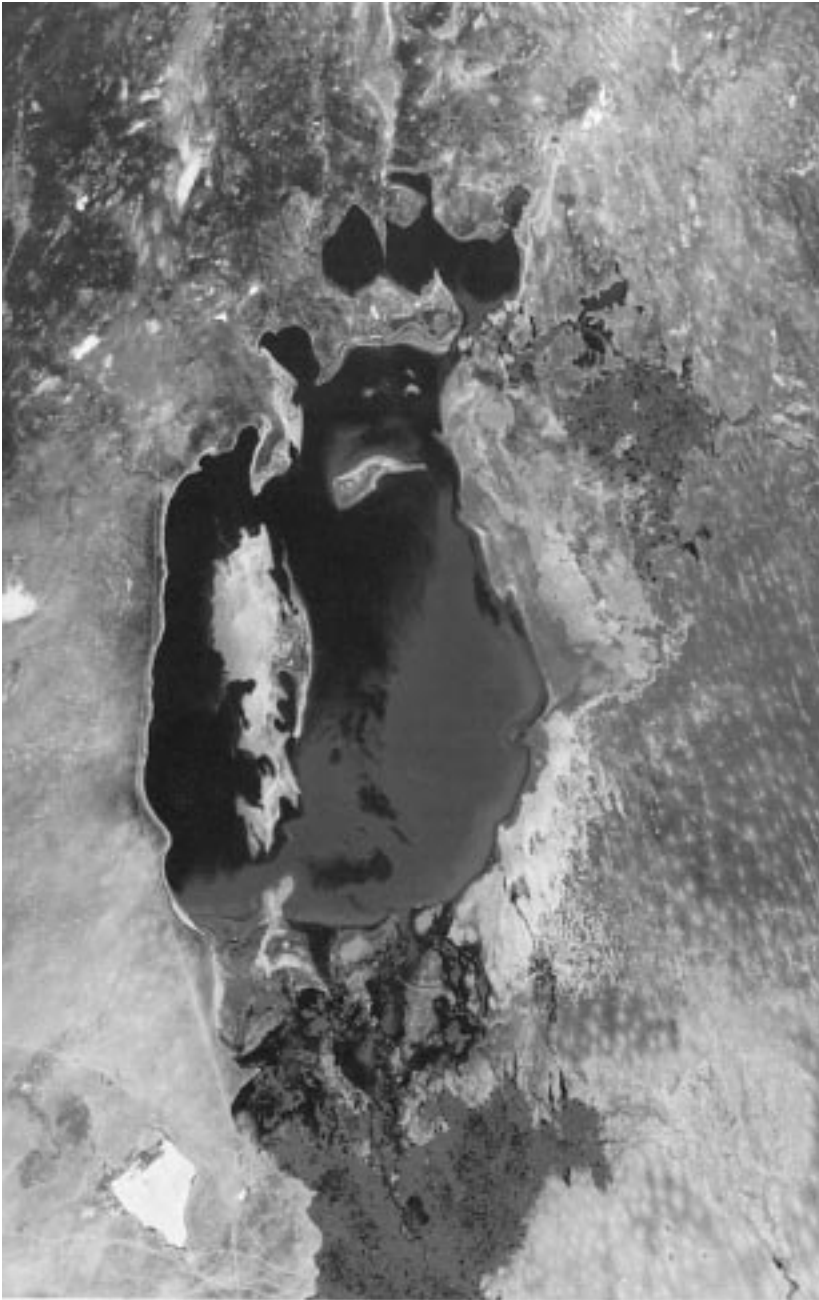
Figure 3. Aerial Photo of the Aral Sea